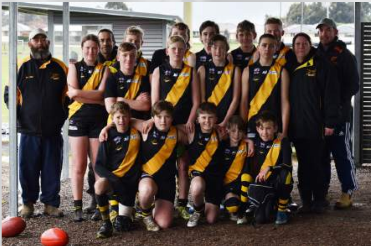
Orange Tigers Under-12s and Under-14s.