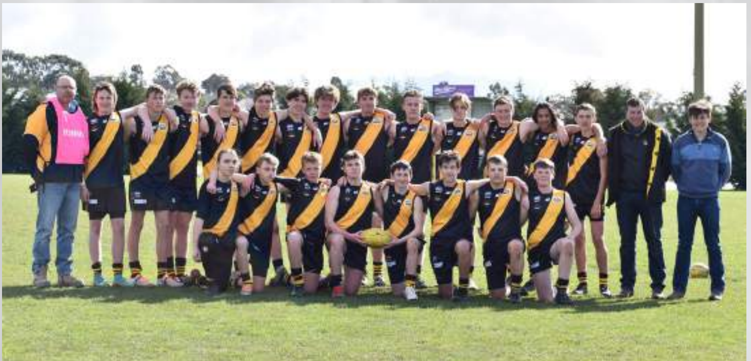
Orange Tigers Youth Girls and Under-17s.